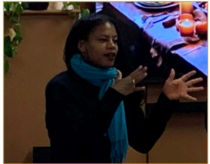
Senator Lydia Edwards addresses the crowd