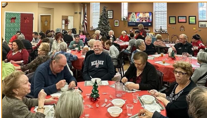
A view of the crowd